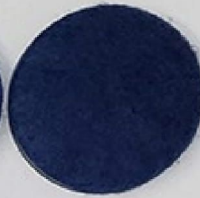
DB-26 MIDNIGHT BLUE