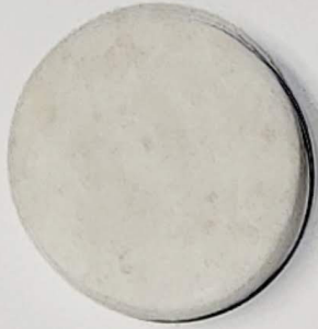
DB-01 SAND DOLLAR