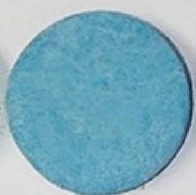
DB-24 SKY BLUE