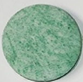
DB-22 HEATHER GREEN