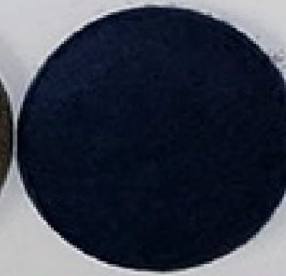
DB-31 BLUE JEAN