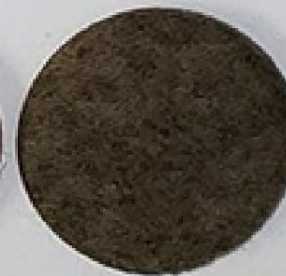
DB-30 EARTH BROWN