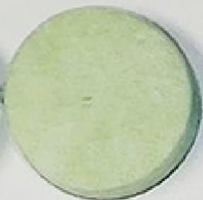
DB-23 HONEY DEW